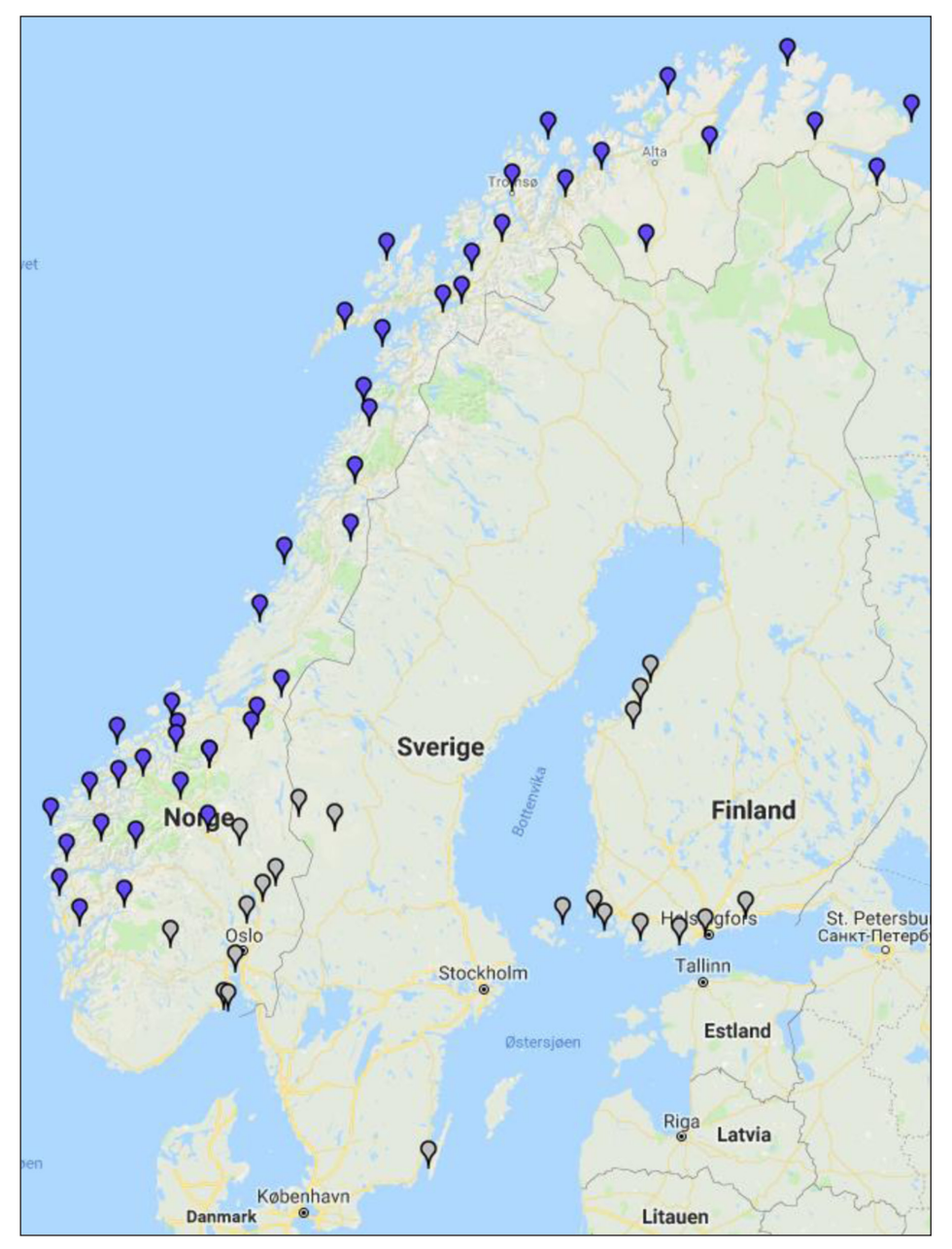
Map 8: Locations with high average scores for presence of complementiser som under subject wh-extraction (blue markers) versus locations with high average scores for presence of complementiser at under subject wh -extraction (grey markers).

Norway, marked as "?" in Map 5, in particular stands out as an area with an unclear pattern.