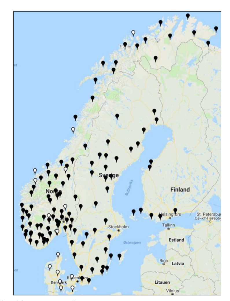
Map 1: Unsplit infinitive: neg – C – Vinf.

Figure 2: Some of the results of the evaluations of sentence no. 143 (the unsplit, "Danish pattern").