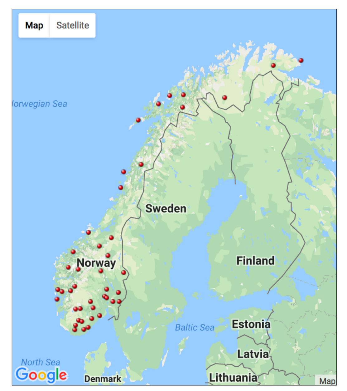
Map 4: The 60 hits of split infinitives found in the NDC spread across 41 locations in all of Norway.

What this investigation shows, is that when the researcher is fortunate enough to have a database of evaluations for a particular structure, there will be hits for all the locations investigated. A corpus does not necessarily cover all locations if a construction is not among the most common ones. Still, the corpus can be used to check whether informants in the database have given answers that are indeed compatible with their own language production. Our investigation in this particular case shows that this is indeed the case. The placement of the adverb with respect to the infinitival marker in Norwegian turns out to follow the Swedish pattern, illustrated in Maps 1–3, and the production data from the corpus show the same, even more convincingly, in Map 4. And the whole infrastructure together shows that the claim made in the Norwegian reference grammar (Faarlund et al. 1997) is not supported by our empirical investigations.