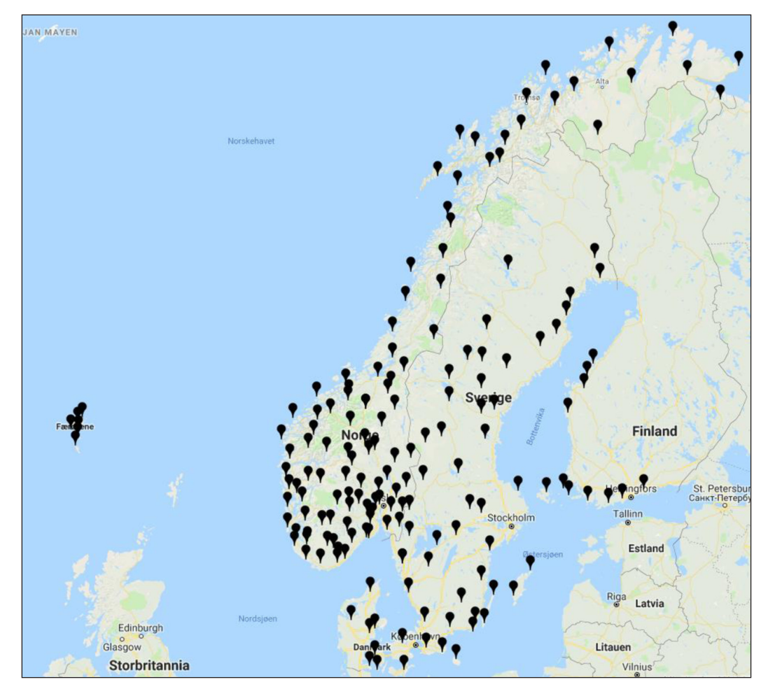
Map 3: The "Icelandic pattern": C - Vinf - neg.

On the basis of these considerations, it is worth investigating to what extent data from the corpus of spontaneous speech corroborate the results from the database. Defining a search for the "Danish pattern" is, however, not trivial since a negation preceding the infinitival marker may belong to the matrix predicate rather than to the infinitival clause: the example in (4) is ambiguous between a high and low attachment for the negation. This is not the case with the "Swedish pattern", see (5), repeated from (2).