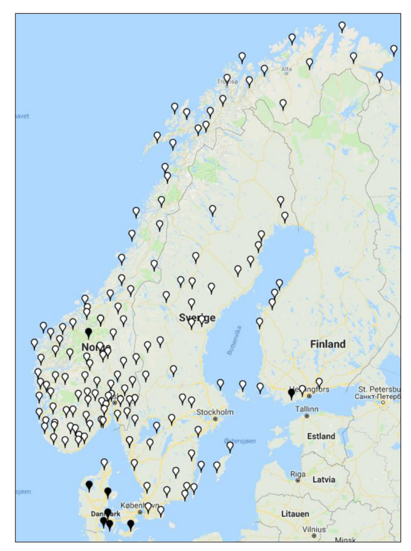
Map 2: Split infinitive: C - neg - Vinf.

A striking result from the database data, evident from the maps, is that the "Danish pattern" is hardly accepted at all by the informants from the Norwegian measure points. Only at ten locations in Norway have the informants accepted it, and these are spread quite evenly across the country.