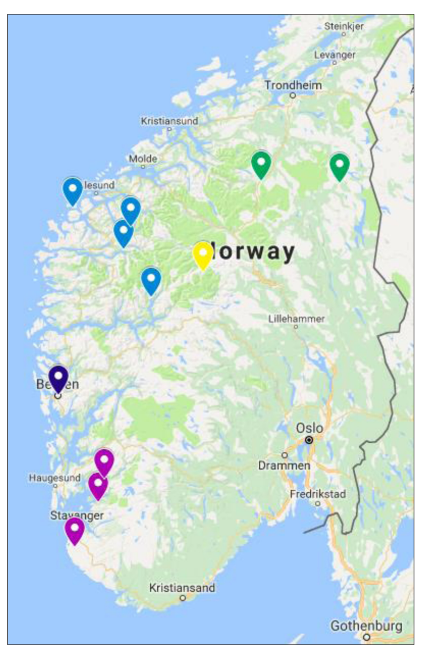
Map 6: Locations at which the Nordic Dialect Corpus provides examples of non-V2 with complex wh-constituents.

The yellow icon marks the single example from a location in the northwest corner of the Eastern Norwegian dialect area, more specifically from the place Lom, which by the