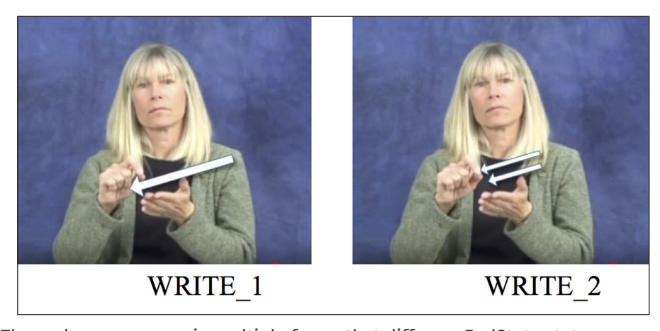
Figure 2: The verb WRITE occurs in multiple forms that differ on EndState status.

Now, we consider a different form, WRITE_2. By any account this sign is morphologically related to WRITE_1 in that it has the same lexically-specified handshape for both hands, orientation, and location, and a closely related meaning. The only difference is that now the movement involves multiple smaller sideways swipes of the dominant over the nondominant hand. Although as far as we are aware the existing literature on the Event Visibility Hypothesis does not focus any attention on verbs like WRITE which seem