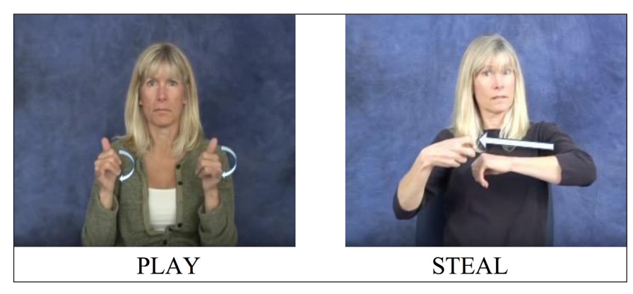
Figure 1: Video stills of ASL verbs PLAY and STEAL.

Since the status of this EndState marker as an iconic morpheme puts sign languages in a unique typological class, there have been several extensions of this work to investigate the boundaries of both the morphemic and iconic components. Some of these extensions focus on the iconicity and its transparency , namely whether some regularity related to the EndState marker is available to both signers and nonsigners alike when perceiving sign language structure. For example, Malaia & Wilbur (2012) argue that there are physical characteristics of EndState that can be quantified – rapid deceleration, for instance – which seem to transparently encode the proposed boundary semantics of the morpheme through a bounded physical motion.